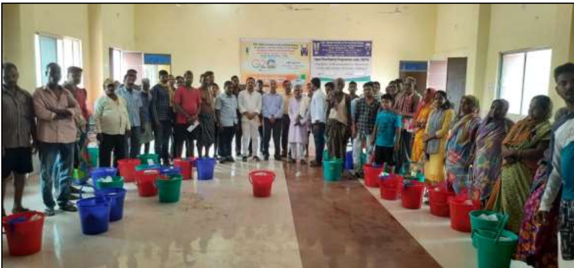
Photo 4: Group photo of Inputs distribution under DAPSC to SC farmers of Harirajpur GP in G20 summit