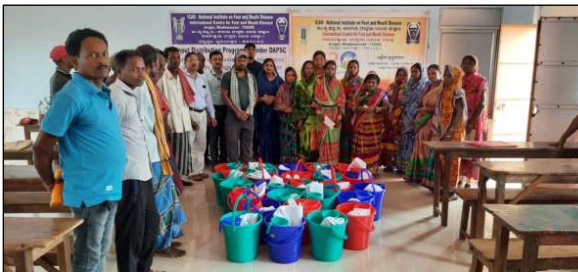
Photo 6: Group photo of Inputs distribution under DAPSC to SC farmers of Ichhapur village of Rengal GP in G20 summit