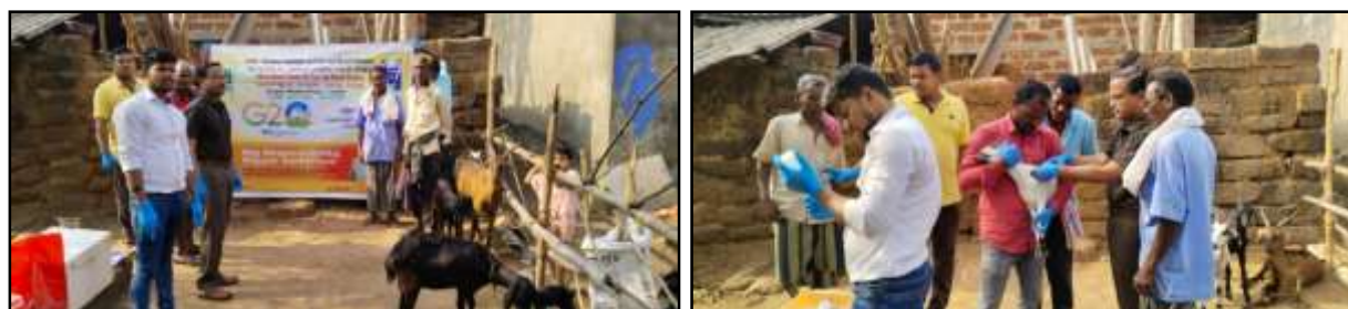
Photo 7: PPR vaccination in goats of SC community in Barakuda village under G20 summit