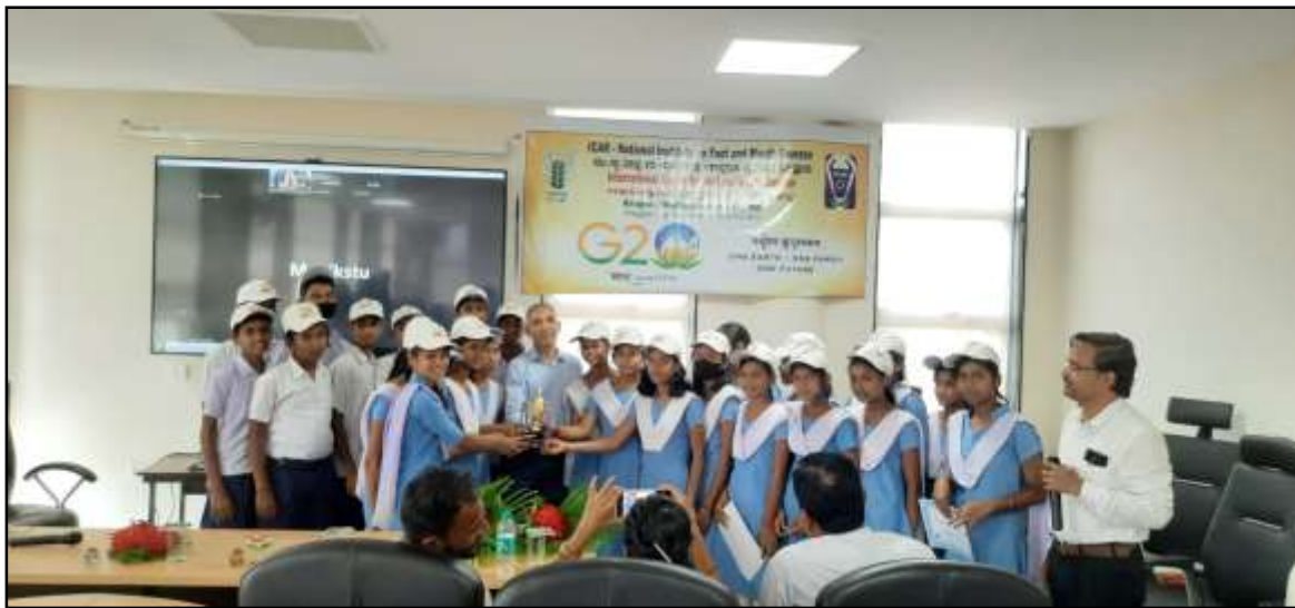
Photo 1: participation of Students of Aragul Govt High School during Utkal Divas at NIFMD