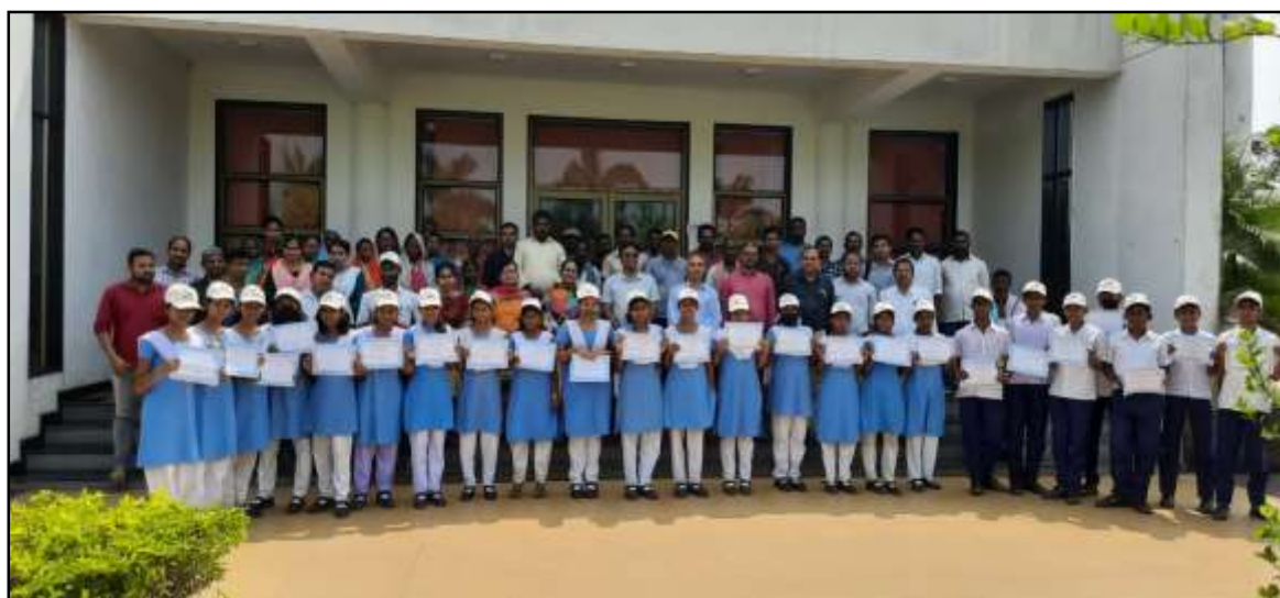
Photo 2: Teachers, Students of Aragul High School with certificates and caps with G20 logo after the event with the Director, Scientists and Staff of NIFMD